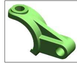
Figure 1. Example product (bracket)

Encoding the core constructs in the PSRL enables a generic formal representation of product information. More concepts need to be encoded within the PSRL. These provide more specific and instantiable constructs in the PSRL. The development of such new concepts utilizes the core constructs that have been mentioned in this section.